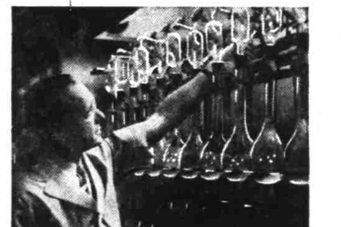
Testing tobacco. Samples from every tobacco-growing area are analyzed before and after purchase. These extensive scientific analyses, along with the expert judgment of Lucky Strike buyers, assure you that the tobacco in Luckies is fine!