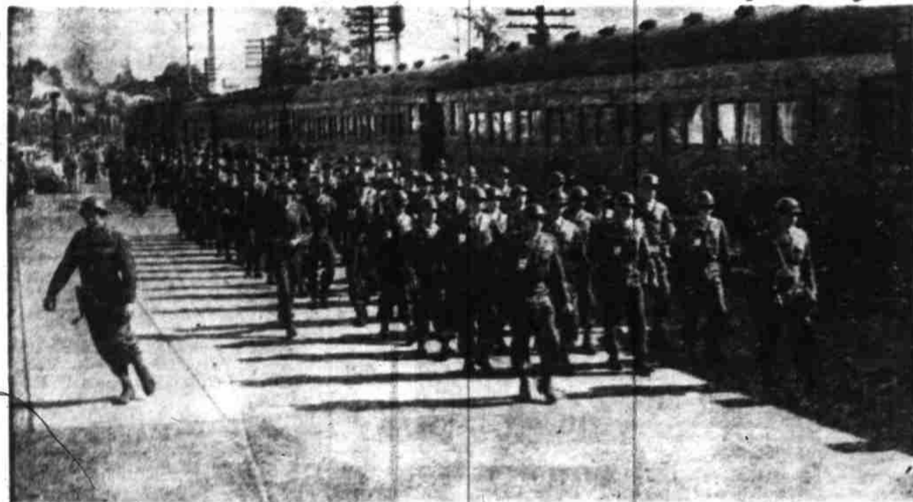
Today will see members of the Oregon national guard starting their yearly two-weeks training period at Ft. Lewis, Wash. Above, Salem's two guard companies are shown marching to their cars at the Southern Pacific depot early Saturday morning.