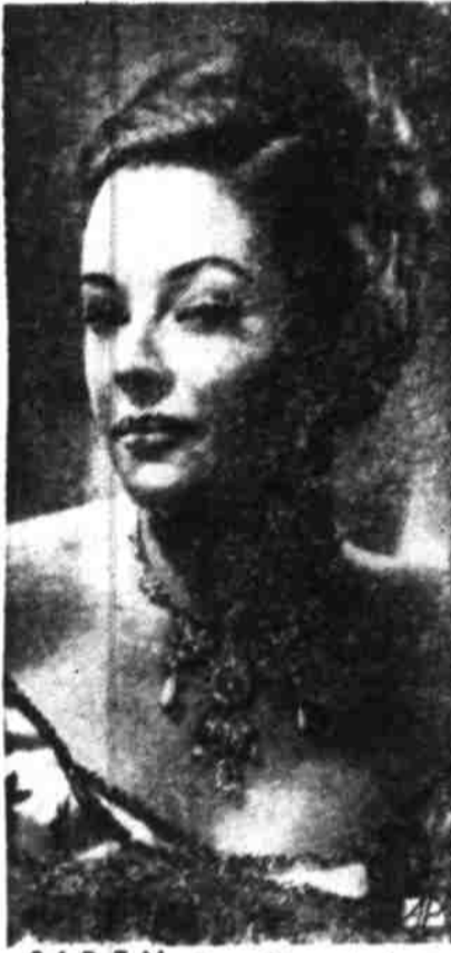
SIREN —Jane Greer is dressed for role as a sophisticated siren in a historical adventure movie set in 1882.

Scholarships to Salvation Army summer camps will be awarded one boy and one girl from Marion and Polk counties whose acts are judged by three Salem church and civic leaders to be outstanding. Entries will be through 250-word letters submitted by June 27 to the Salvation Army by a parent, neighbor or acquaintance telling the good deeds of a 12 to 18-year-old. The incident may cover a single time or any period of the school term just ended. The 10-day scholarships will be to Trestle Glen camp, northeast of Oregon City, for either the youth camp or the music camp.