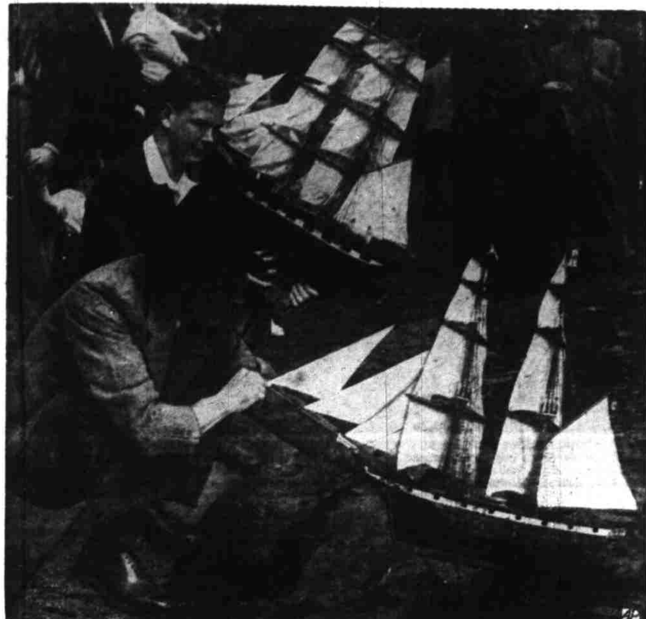
ROLLING DOWN THE SAILING POND — Model boat builders test their replicas of famous sailing craft in a week-end meeting at Round Pond, Kensington Gardens, London.

Miss Underwood graded the paper with a replying 50-word theme: "Once upon a time I graded a theme. I thought and I thought and I thought . . . and finally I decided to give Billy Higginson a D—."