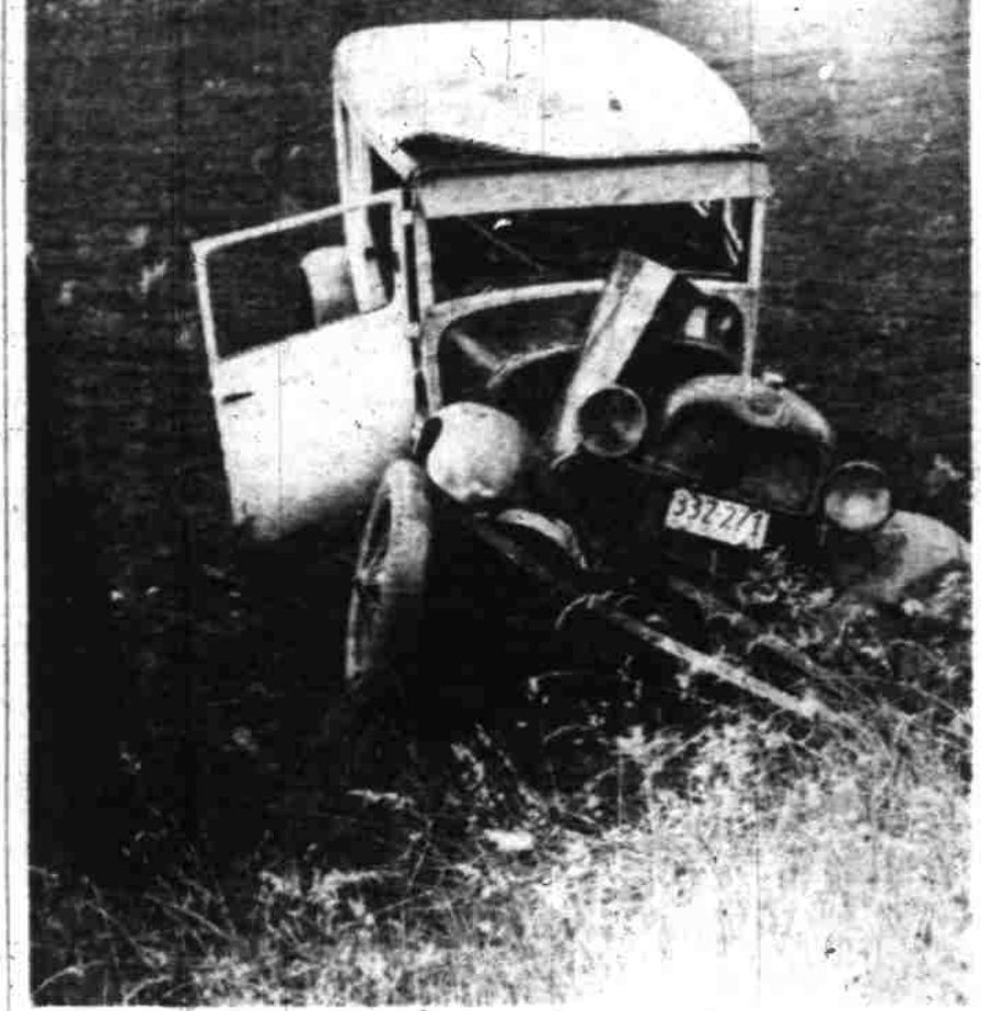
Two teen-age youths were injured, one seriously, when this 1929 auto crashed into a power pole south of Salem Tuesday morning. The wrecked car is shown lying in a field beside the battered pole. Injured were Fred Lambert, 17, and Neil Stratton, 16, both students at Salem Academy.