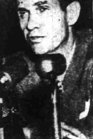
New York, May 31—Almer Hiss, ex-state department official, was back in the spotlight today as his federal court trial for perjury began. He is accused of giving false information regarding his relations with wittaker Chambers, ex-courier for a communist spy ring.