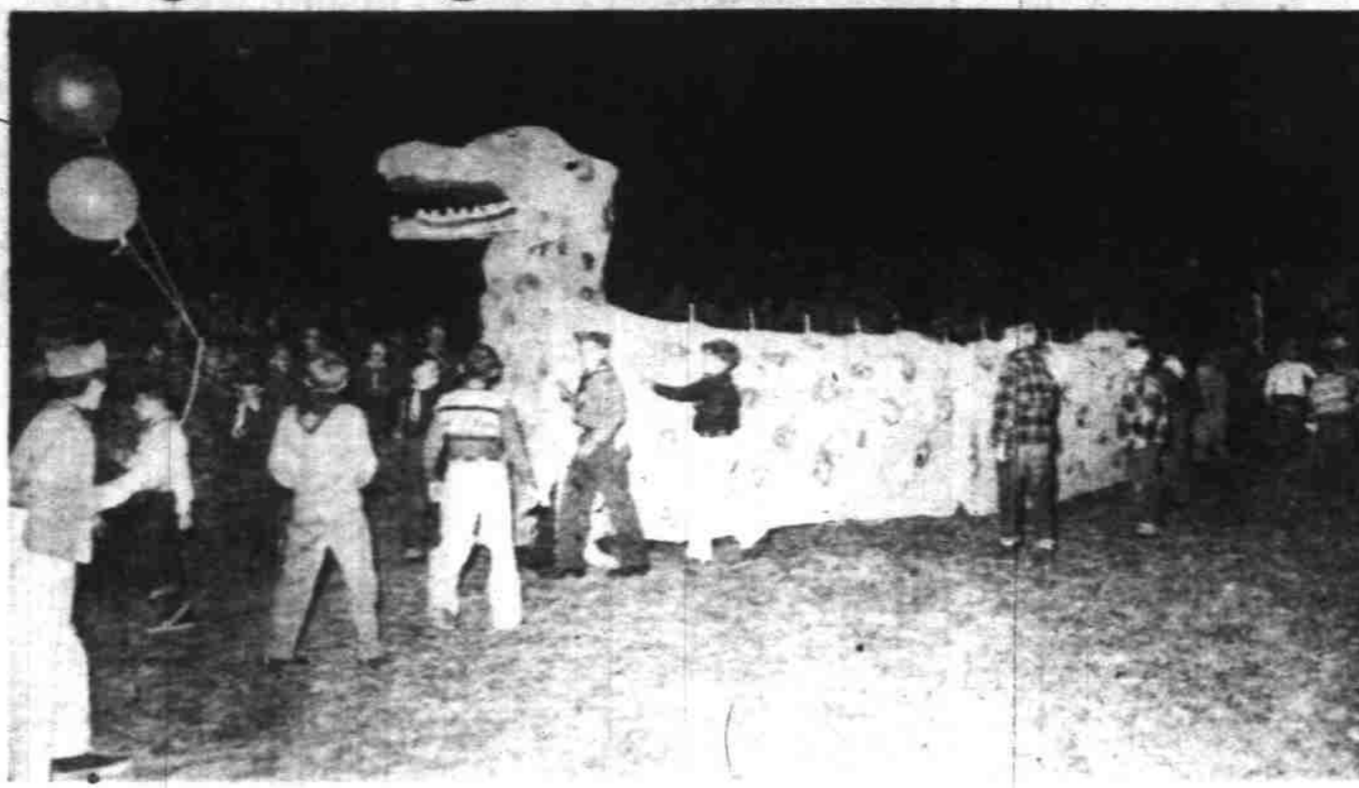
Among all the animals and creatures of the Animal Fair act of the annual Boy Scout circus was this huge dragon of Cub Pack 17. Other animals ranged from penguins, skunks and monkeys to shmoos.