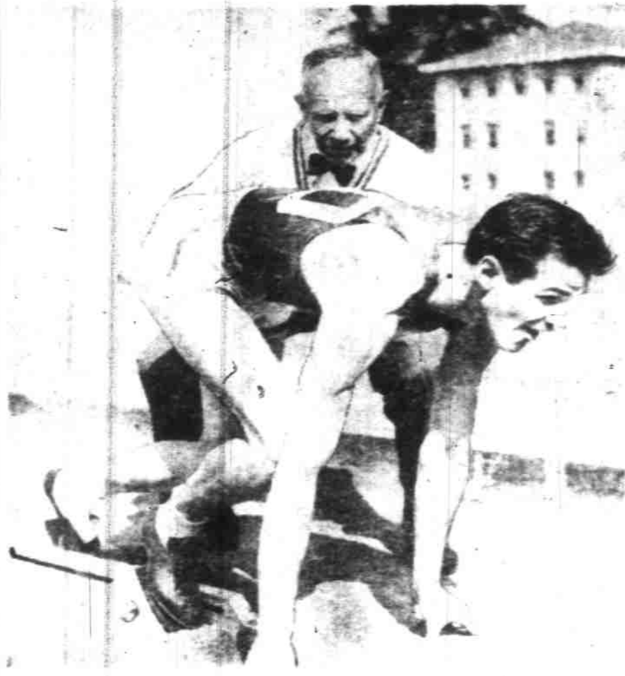
Mel Patton, shown with his famed coach Dean Cromwell, who is now track adviser for Southern California, Saturday bettered the world 220-yard dash record with a 20.2 romp against UCLA at Los Angeles. Earlier in the day Patton streaked to an unofficial world record of 9.1 in the 100 yard dash.