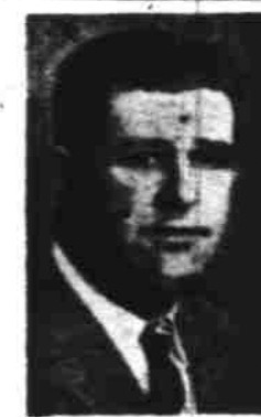
Dr. E. E. Boring