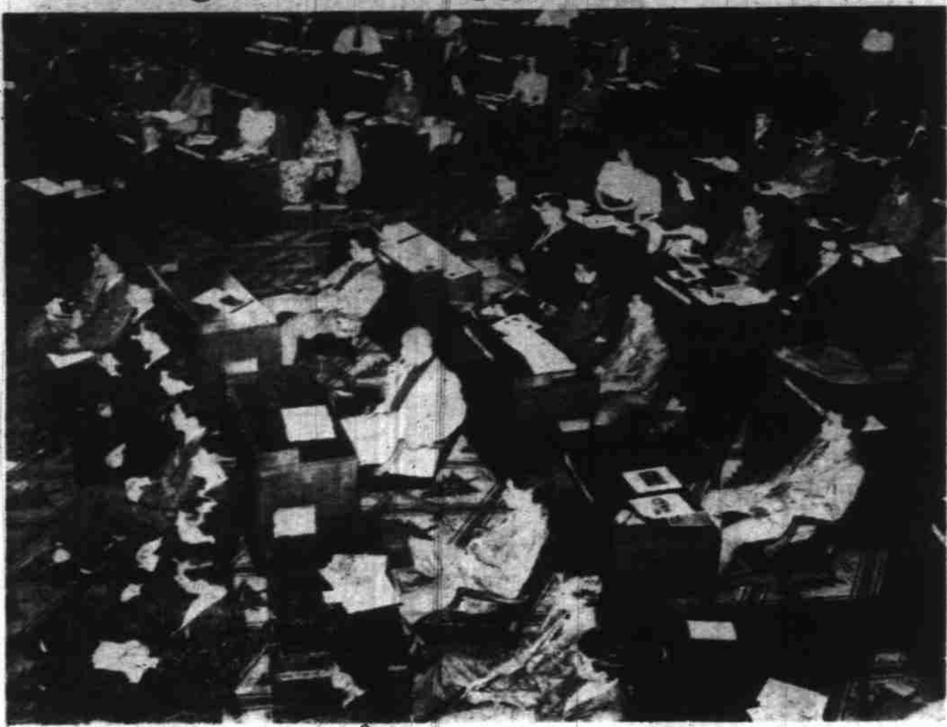
Attentive delegates hear the advice of Gov. Douglas McKay and other leaders as the annual Youth and Government legislative session for Oregon high school youth opened in the state capitol Friday. This picture shows senators (in chairs at left) and representatives in the joint session.