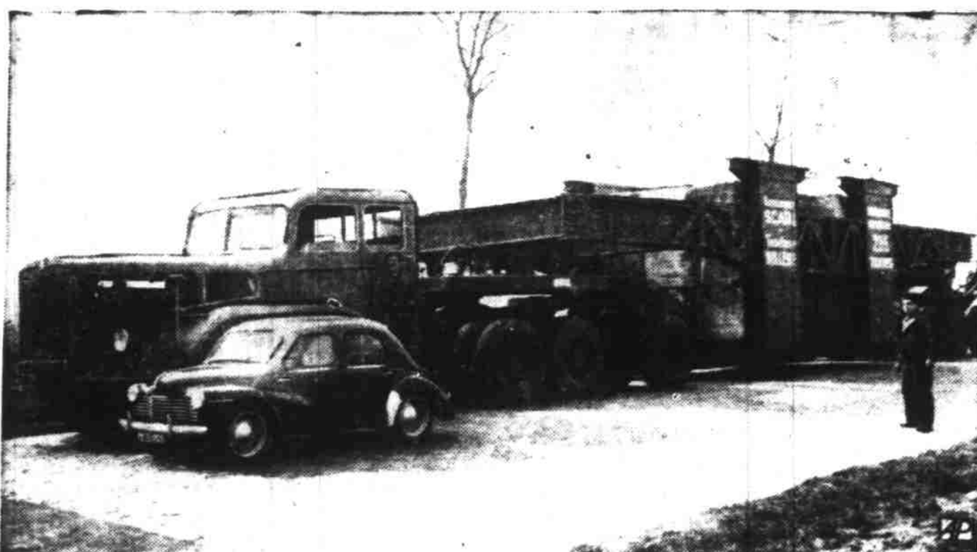
TREMENDOUS TRUCK — One of the world's largest trucks (above) has just been completed in France. It has a capacity of 130 tons, is 86½ feet long, 13 feet tall and 15 feet wide.