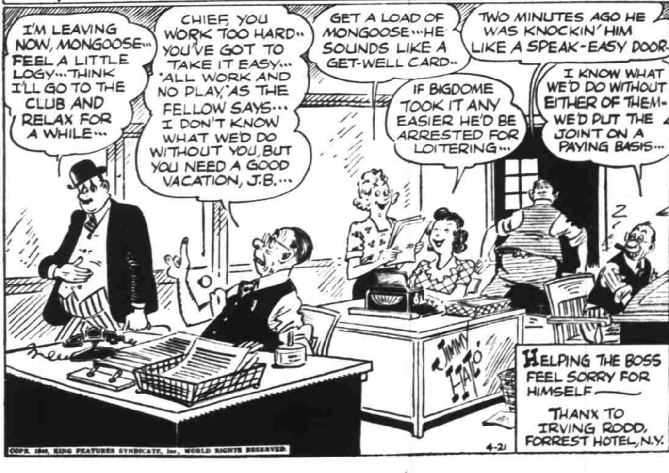
COPIED BY KING FEATURES SYNDICATE, INC., WORLD RIGHTS RESERVED