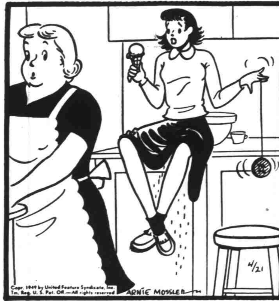
"But, Mother, why must you treat me like a mere child!"