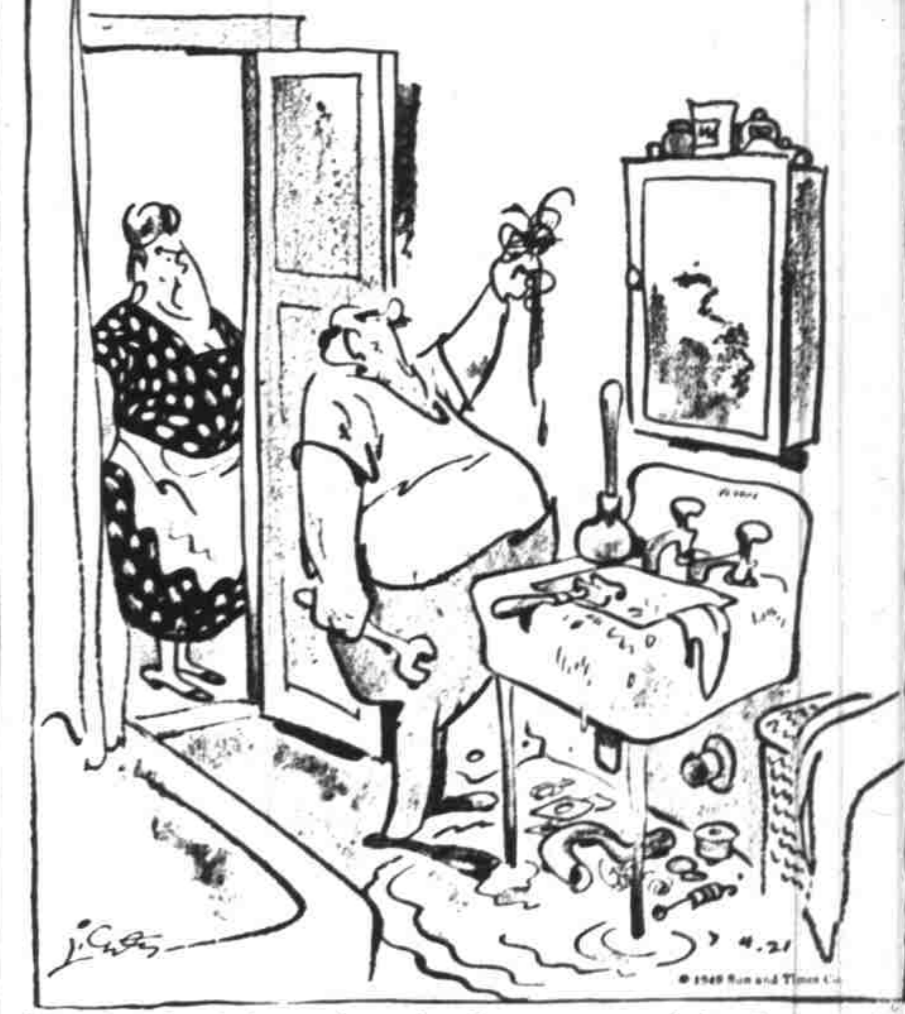
"Strange, that hair can be so lovely on a woman's head... and so unlovely clogging the drain..."