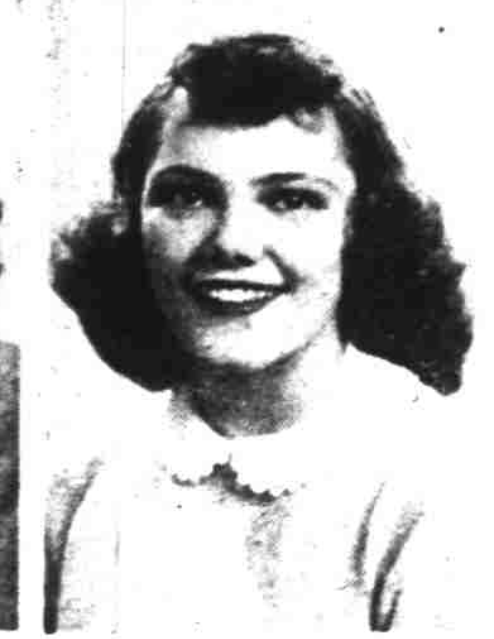
will represent Independence

These Willamette valley lovelies are among the candidates for the court of Salem's 1949 Cherryland festival. They will vie at the Princess Selection night April 21 in Salem high school auditorium to be sponsored by Salem Cherrians. All the girls (15 have been selected so far) are high school seniors and are the choice of students in their schools. Their records show them not only to be popular but among the most active participants in school organizations.