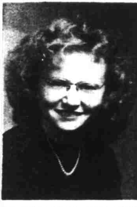
telle, Independence route 1, was chosen by Monmouth high.