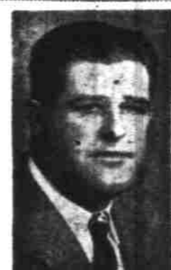
Dr. E. E. Boring

Box 212, Brooks, Ore. Catalogue Free on Request