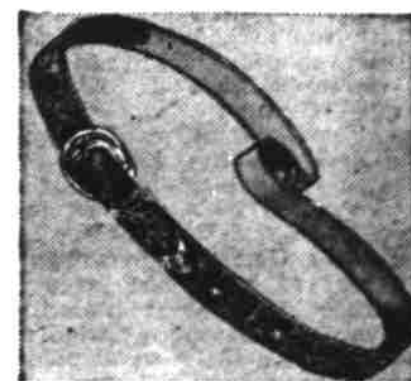
Boys' Western Belt