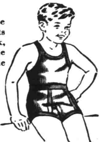
Boyville Jr. Warm Underwear