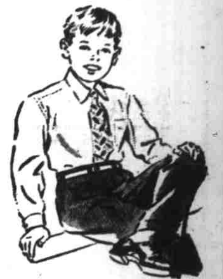
Warm Boyville, Jr. Dress Longies

Snug-fitting, action-free boy's white cotton short sleeve undershirt and elastic waist shorts. Sizes 2-4-6-8.