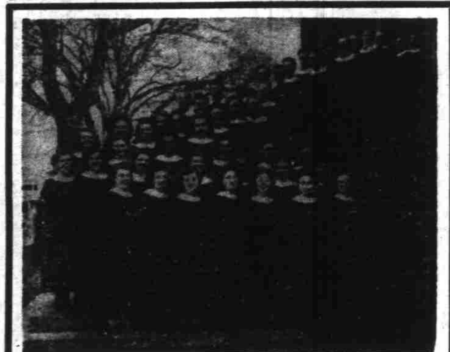
Seattle Pacific A Cappella Choir

Animals which have been domesticated since the dawn of history include the dog, ox, sheep, goat, horse, camel, cat, goose and elephant. No animal of economic importance has been brought in to domestication within the past 2,000 years.