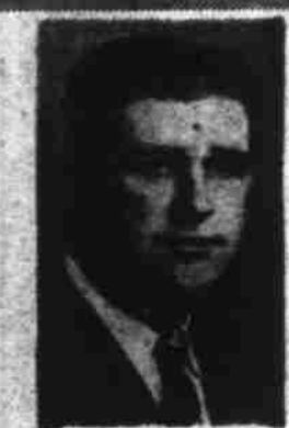
Dr. E. E. Boring