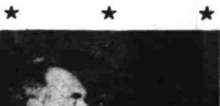
WASHINGTON, March 18—Secretary of State Dean Acheson discusses the Atlantic pact with newsmen today just prior to the release of the text.