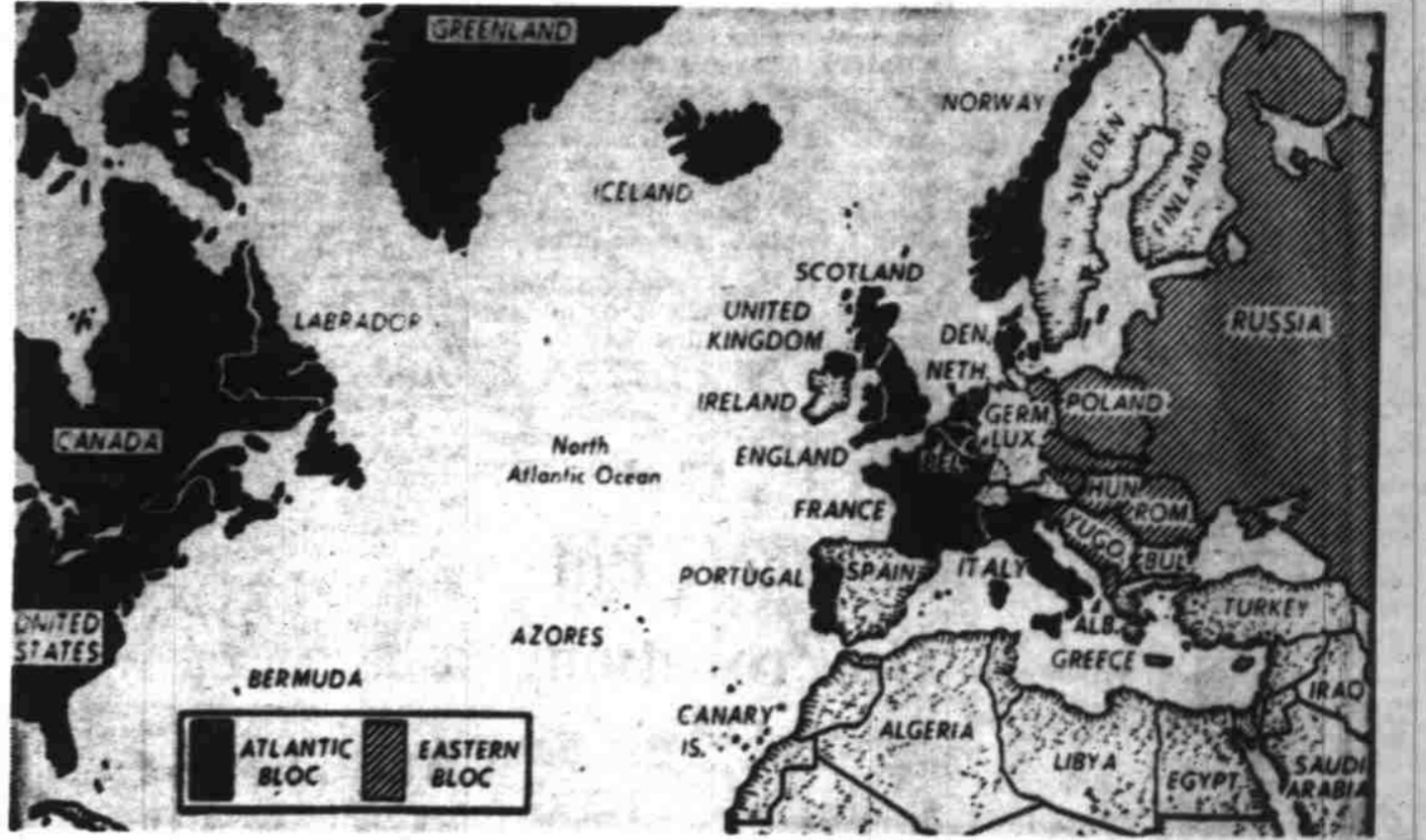
WASHINGTON, March 18—Countries shown in black on map are those to be united under the North Atlantic Security pact, details of which were made public today. Shaded countries are those under the domination of Soviet Russia.