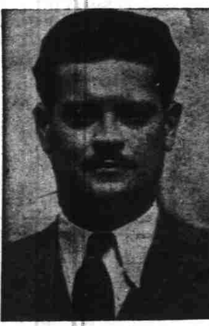
ter eight years as superintenof state boys' training ol to become a chamber of merce secretary.