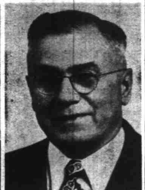
sistant manager of Mt. Angel branch of U. S. National Bank of Portland, after 32 years with the firm.