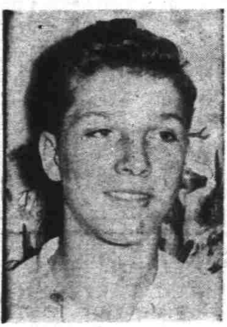
grader and son of the Roy Websters, 380 Taylor st., won first in Oregon crayon drawing con-