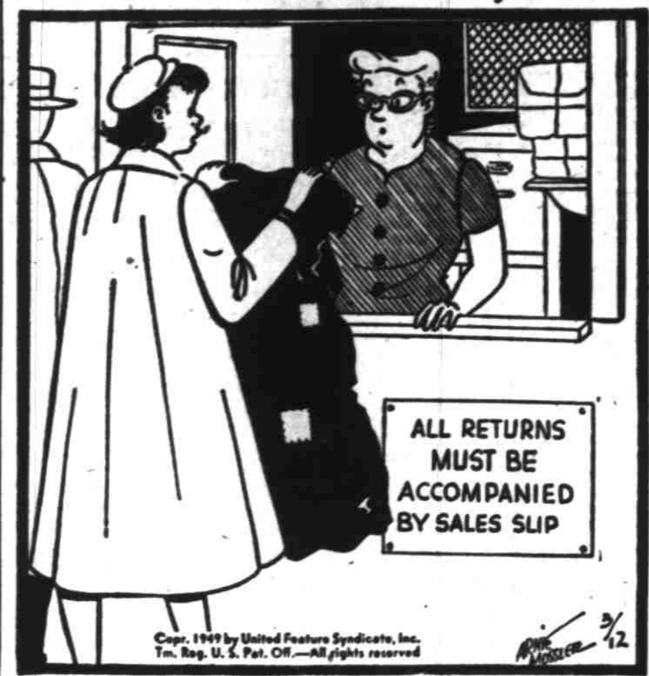
Copyright, 1949 by United Feature Syndicate, Inc. All rights reserved.