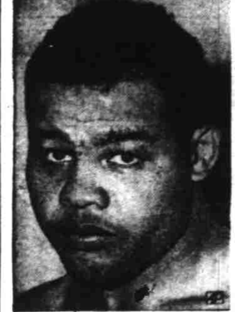
JOE LOUIS Champ Quits Unbeaten