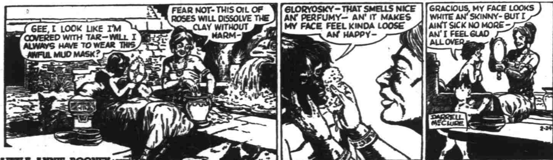
LITTLE ANNIE ROONEY