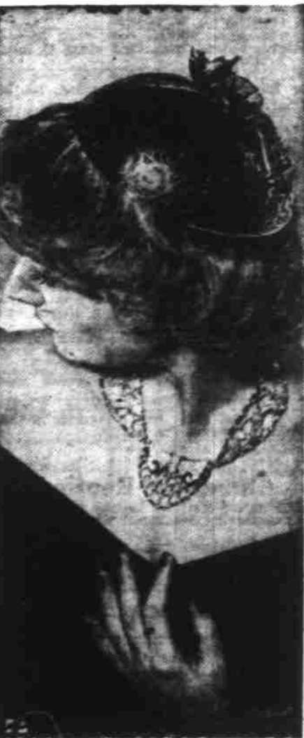
HAT OF GOLD —Styled after an ancient Gallic helmet, this golden cap, topped by diamond-studded wings, is valued at one million French francs by Mellerio, Paris jeweler.