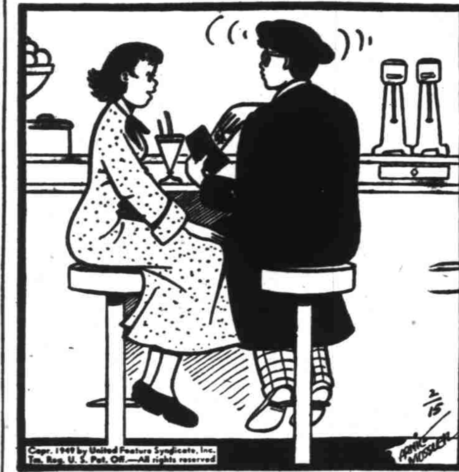
"You look so handsome, when you're handling money, Buford!"