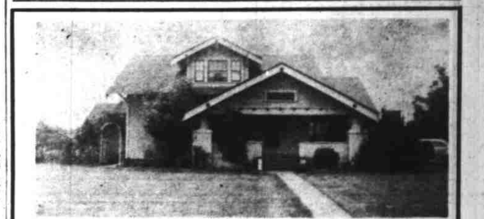
Fine country home. Modern 3 bedroom house, barn, chicken house, 10 acres good black soil, 5 acres fibberts, 80 large walnut trees, paved highway, bus line. A fine place to rear a family. $14,000. Terms.

PHOENIX, Ariz., Feb. 12—(AP)—Roscoe Ates, 54, motion picture actor, re-married his former wife, Lenora Belle Jumps, here today in a simple single-ring ceremony. The couple had been divorced about four years.