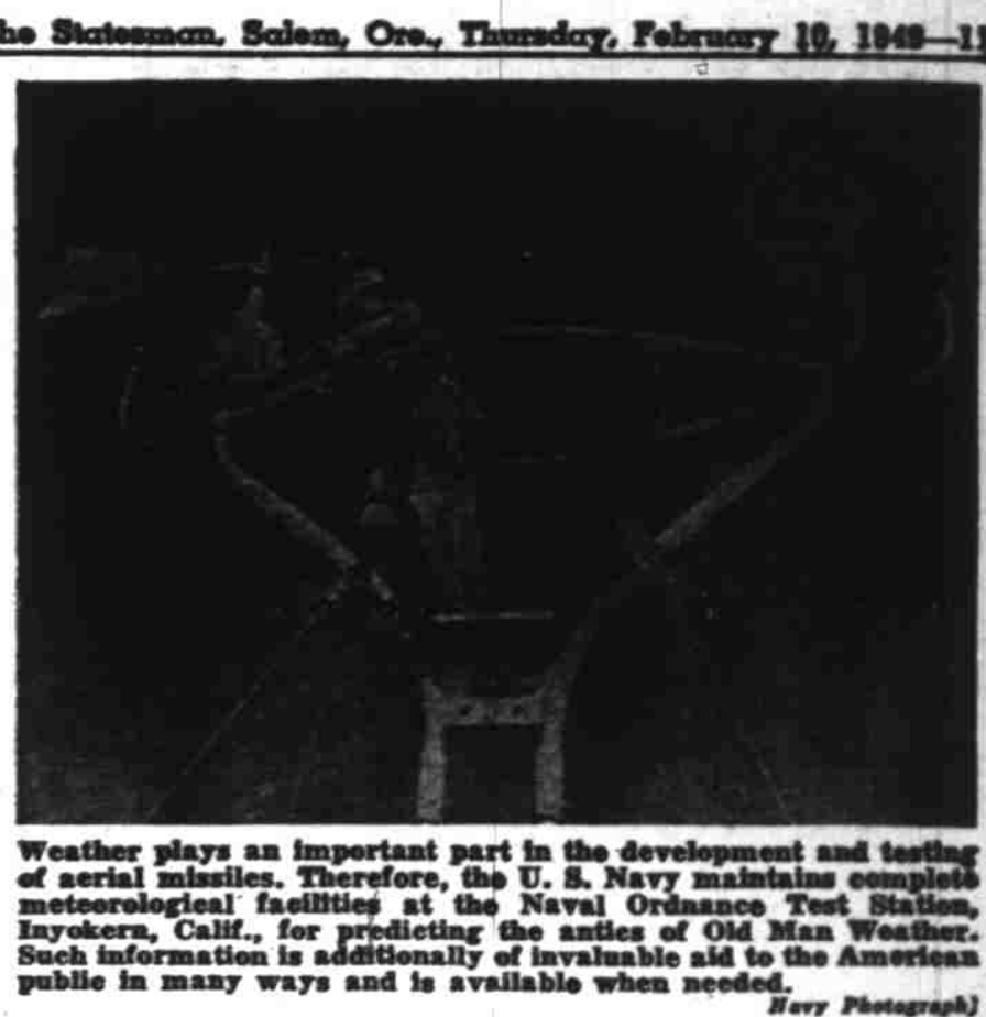
Weather plays an important part in the development and testing of aerial missiles. Therefore, the U. S. Navy maintains complete meteorological facilities at the Naval Ordnance Test Station, Inyokera, Calif., for predicting the antics of Old Man Weather. Such information is additionally of invaluable aid to the American public in many ways and is available when needed.

CREOMULSION Creomulsion relieves promptly because it goes right to the seat of the trouble to help loosen and expel germ laden phlegm and aid nature to soothe and heal raw, tender, inflamed bronchial mucous membranes. Tell your druggist to sell you a bottle of Creomulsion with the understanding you must like the way it quickly allays the cough or you are to have your money back.