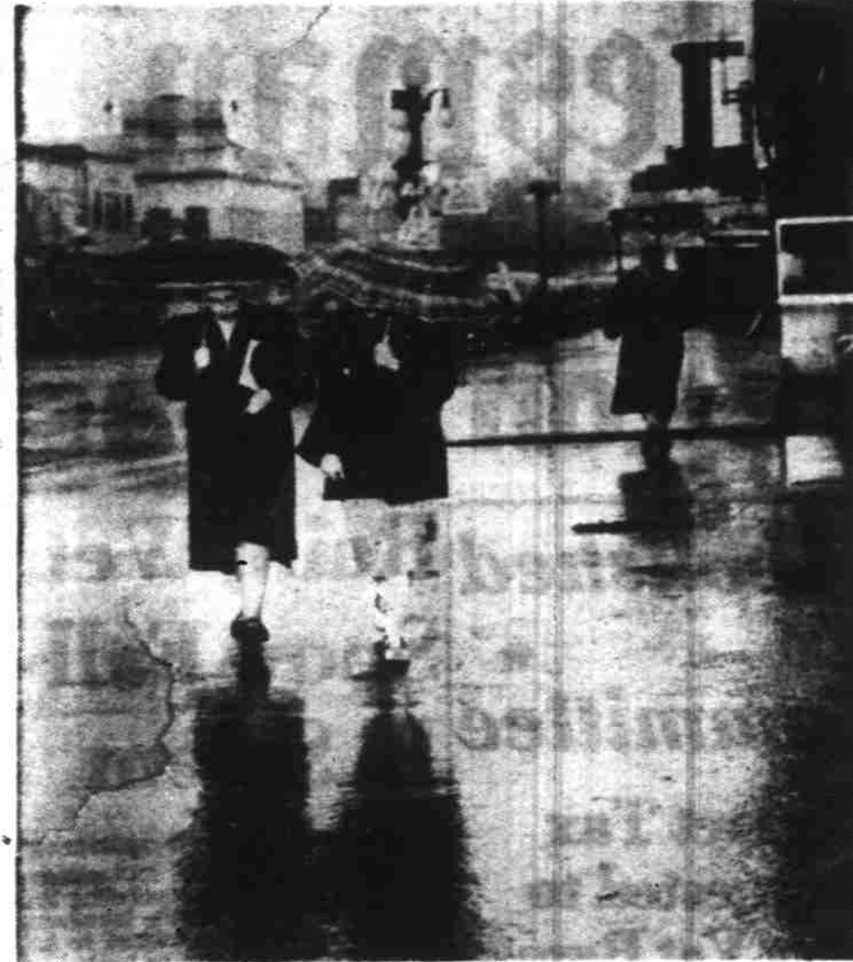
Salem's streets looked "back to normal" Thursday with rain running down the gutters and umbrella-clad Salem residents hurrying to shelter like the two pictured above at the corner of State and Liberty streets.