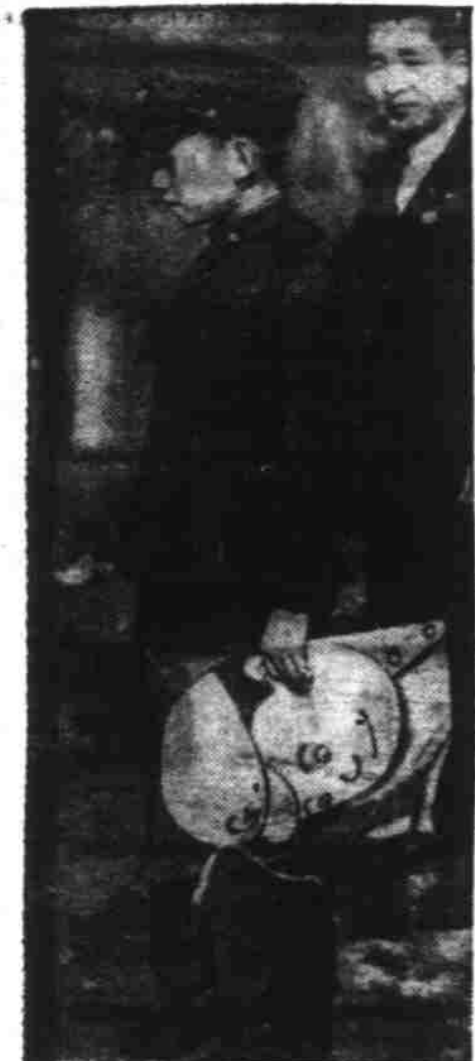
ROYAL KITER —Prince Masahito, youngest son of the Japanese Emperor, holds his life as he looks over the proceedings at the New Year's kite-flying contest in Tokyo.