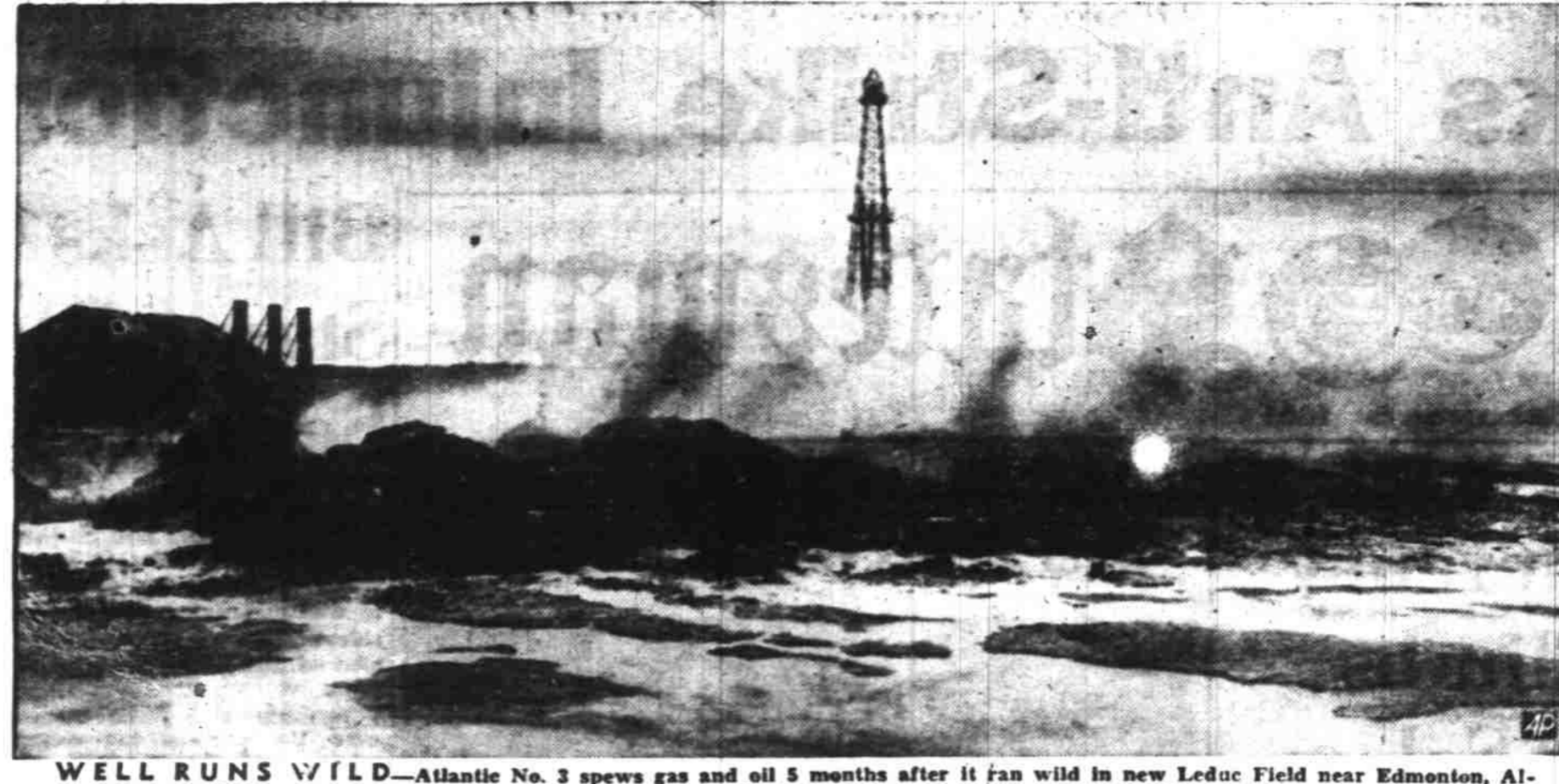
WELL RUNS WILD—Atlantic No. 3 spews gas and oil 5 months after it ran wild in new Leduc Field near Edmonton, Alberta. Well has averaged 14,000 barrels daily, forming oil lake in foreground. Two-year-old field now has 100 producers.

Send TWENTY-FIVE cents in coins for this pattern to The Oregon Statesman, Anne Adams, Pattern Dept., 130 N. Clinton, Chicago 90, Ill. Print plainly NAME, ADDRESS, ZONE, SIZE and STYLE NUMBER.