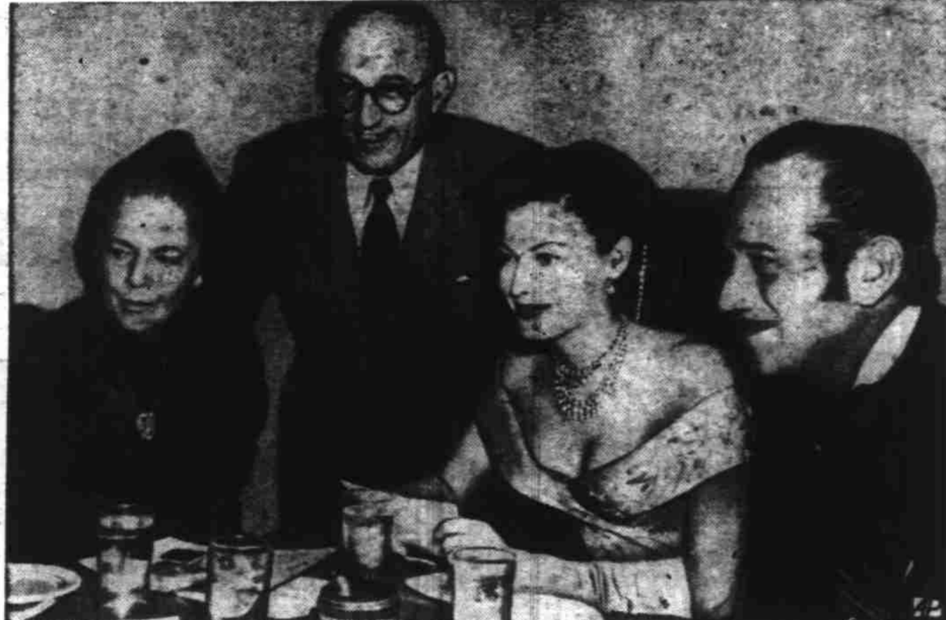
PARTY AT HOLLYWOOD —Attending a luncheon after work on a picture they made are (left to right): Ethel Barrymore, Director Robert Siodmak, Ava Gardner, Melvyn Douglas.