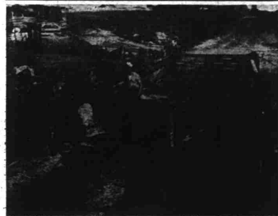
On farms established by the U. S. Naval Government on Guam, American sailors instruct natives in modern agricultural methods. The produce from the farms is used for Naval personnel and the rehabilitation of the natives. In photo above, a seaman, first class drives some pigs to feed.