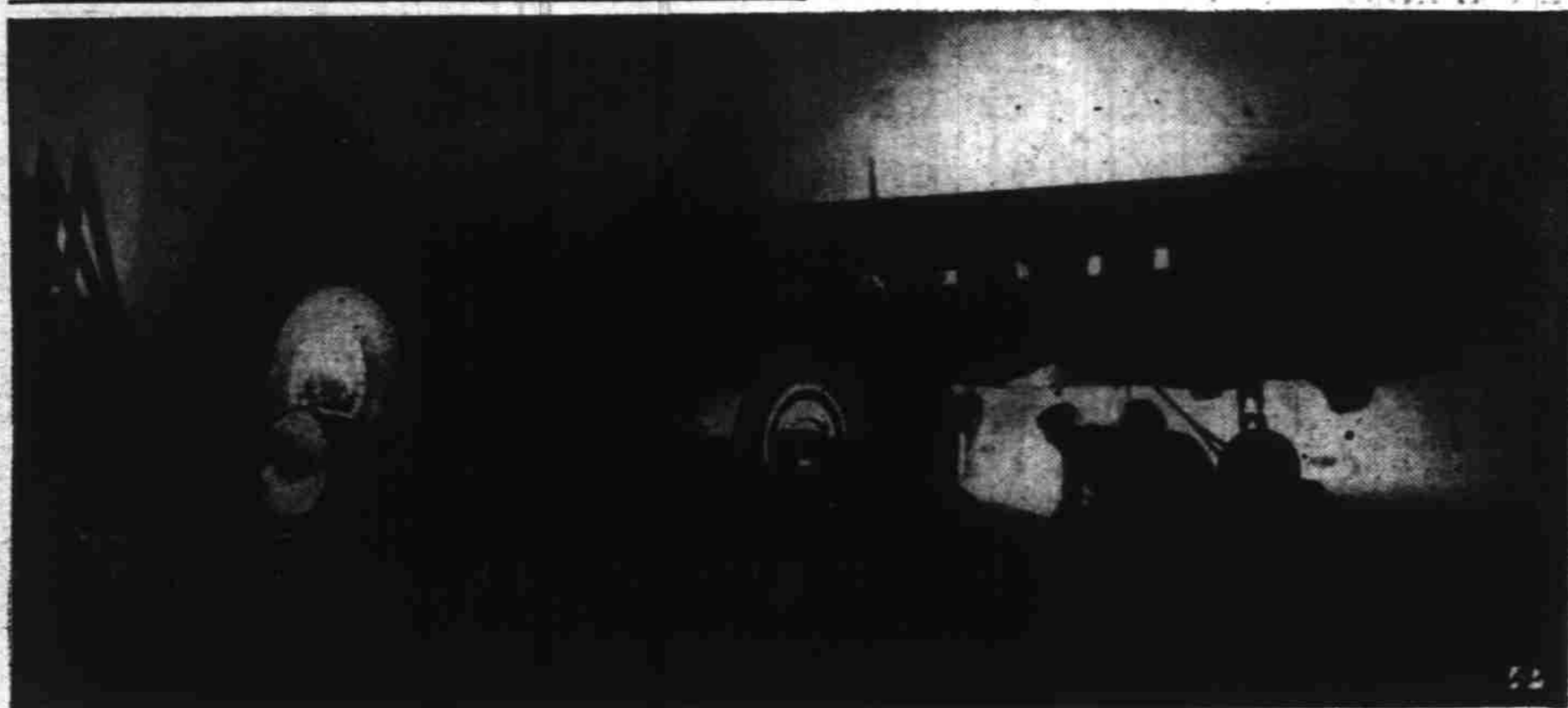
BACKING UP AIR LIFT —Wheels for 4-engine York freighters are brought to a Dakota plane by R.A.F. crewmen at Honington, England, for dawn take-off to Germany. Known as "Operation Plumber," 4 Dakotas ferry unserviceable plane parts from bases in Germany and return with replacements for the giant transports employed in the air lift to blockaded Berlin.