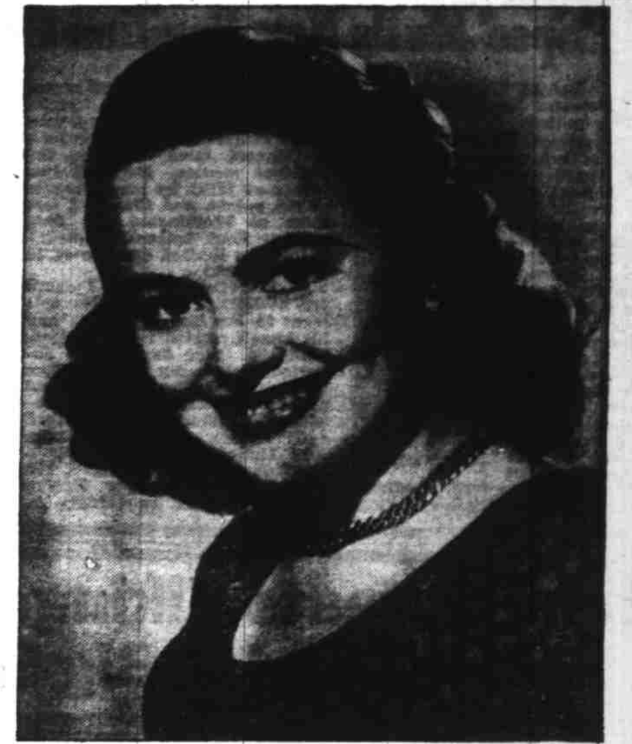
Olivia de Havilland is starred in "The Snake Pit," now at the Grand Theatre. Co-starred with her in the picture is the Mary Jane Ward best-seller are Mark Stevens and Leo Genn.