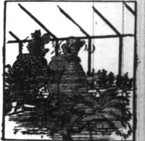
"Hiss-m-m!" A mystery book? I must have been wrong counter—the Statesman Want Ad sold love stories!