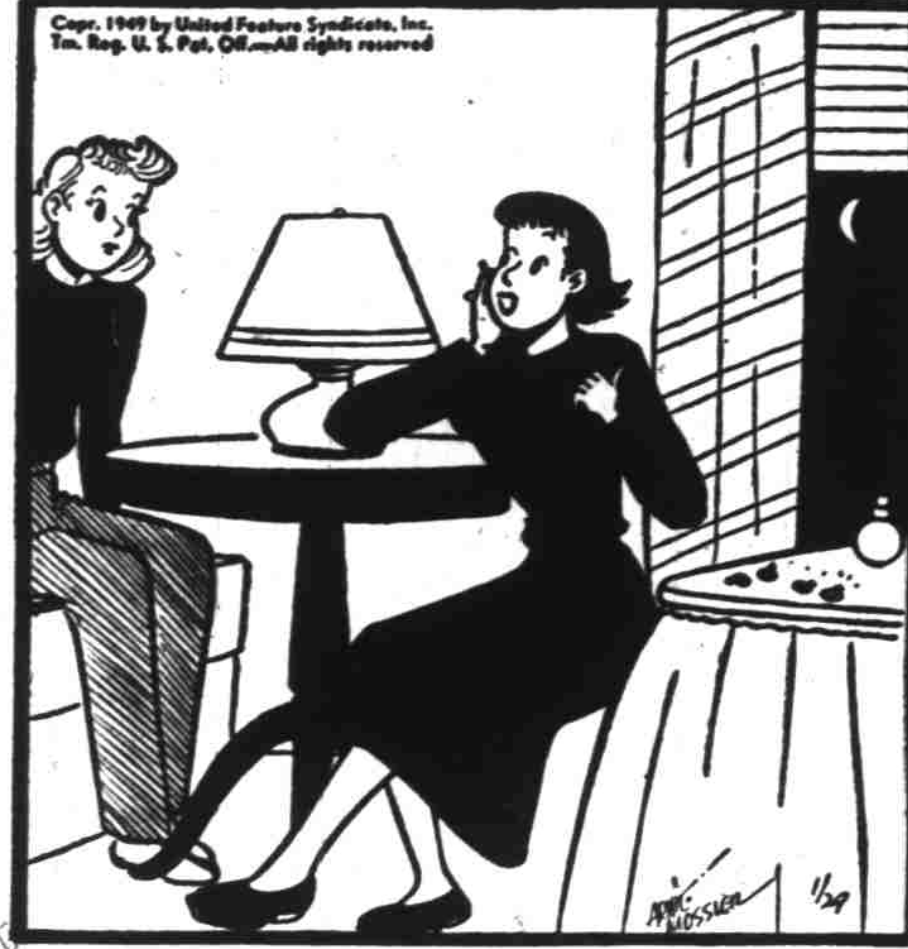
Do you think maybe I could turn some of those old engagement rings into cash!