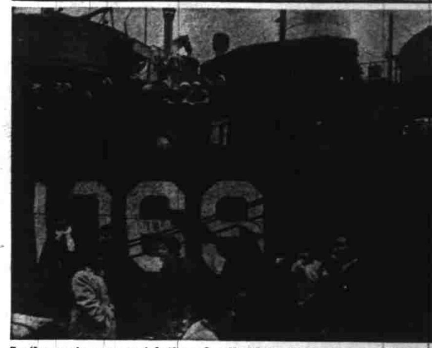
In the post-war repatriation of exiled Korean civilians and Japanese troops to their homelands, U. S. Navy LST's made seven trips to accomplish that mission of mercy. Photo shows crew members of USS LST 1069 watching Korean civilians as they prepare to board the vessel prior to the last trip.