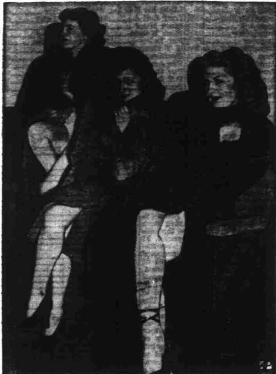
AWAITING CALL —Candidates for places in a London production of the Folies Bergere wear fur coats over their bathing suits as they await the call of the director to audition.