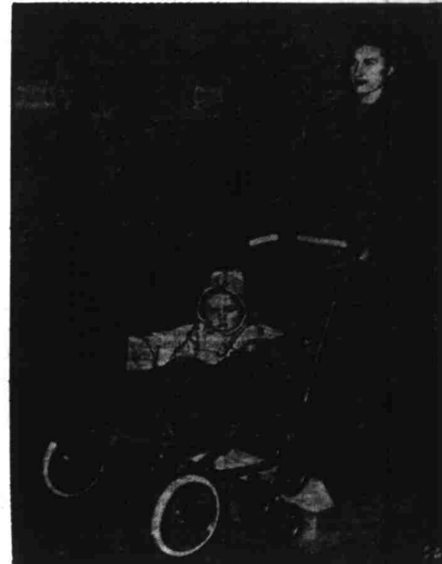
NO-BUMP PRAM —Small wheels attached to the rear axle keep baby's ride smooth even on stairs and street curbs in this carriage shown at the London Inventor's Club exhibition.