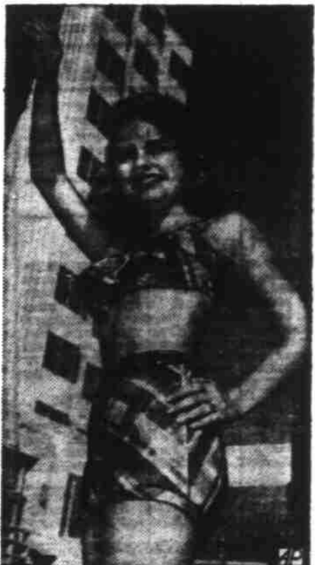
BEACHGOER —Terry Moore, Glendale, Calif., movie starlet, had this picture taken at Miami Beach, she says, to prove that beach costumes look the same in Florida as in California.