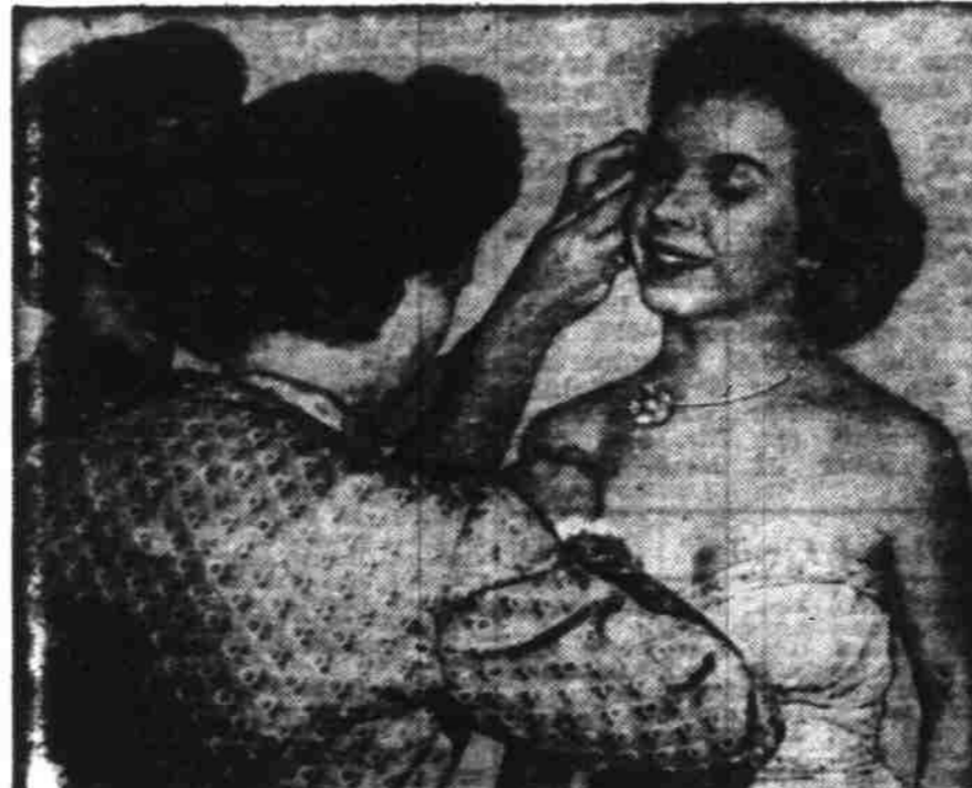
LAST MINUTE TOUCHES —A wardrobe woman and a hairdresser give last minute attention to Diana Lynn before she goes on the set of "Bitter Victory" in Hollywood.