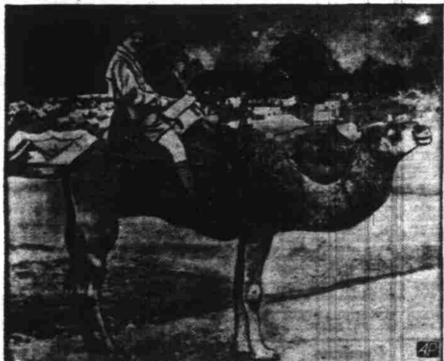
CAMELMAIL ARRIVES —Daily delivery of mail carried by Clarence the camel was a feature of the Pan-Pacific Scout Jamboree at Melbourne, Australia.