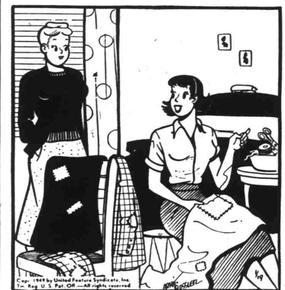
"Holes? There aren't any holes... I'm just getting ready to hit pop for some new dresses!"