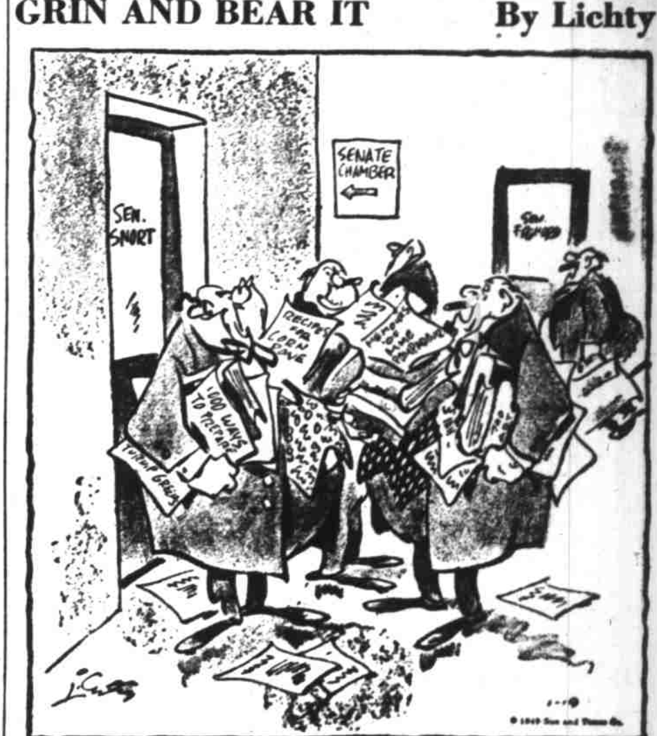
"Now remember!... Just as soon as them new upstart senators mention an anti-filibuster bill... we start filibustering!"