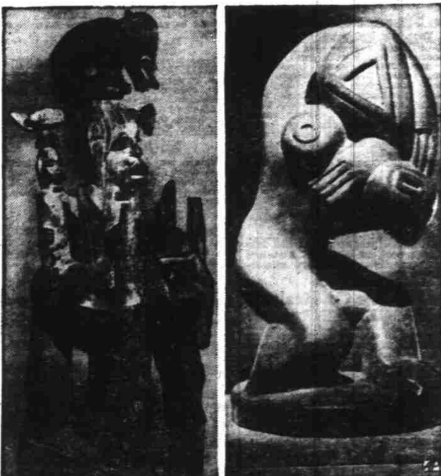
ART, OLD AND NEW — A Nigerian wood carving primitive (left) and "Red Stone Dancer" by Henri Brezka, modern, were shown in the Contemporary Arts exhibition, London.