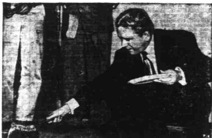
GOVERNOR'S BARBECUE — Governor Fuller Warren of Florida takes a steak from the fire at the giant barbecue, which celebrated his inauguration in Tallahassee.