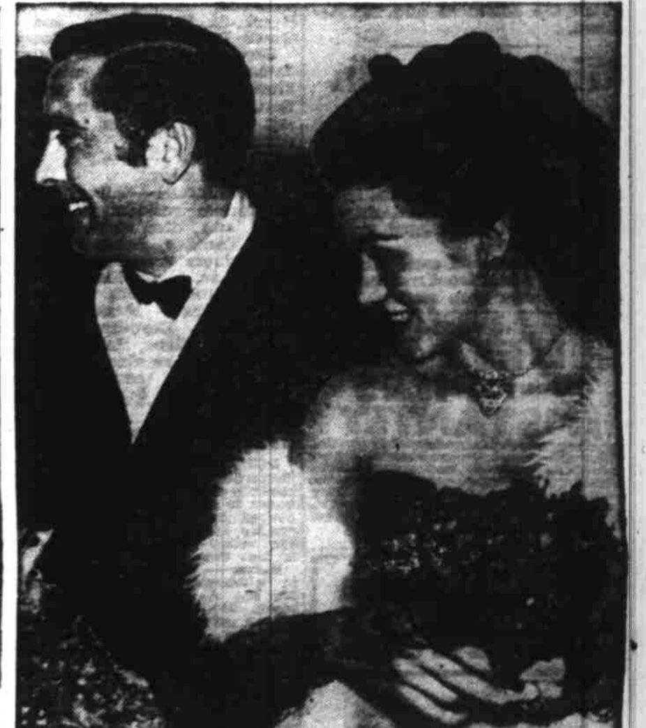
TYRONE AND LINDA — Actor Tyrone Power accompanies actress Linda Christian as they arrive for a private showing of one of his starring films in Rome, Italy.