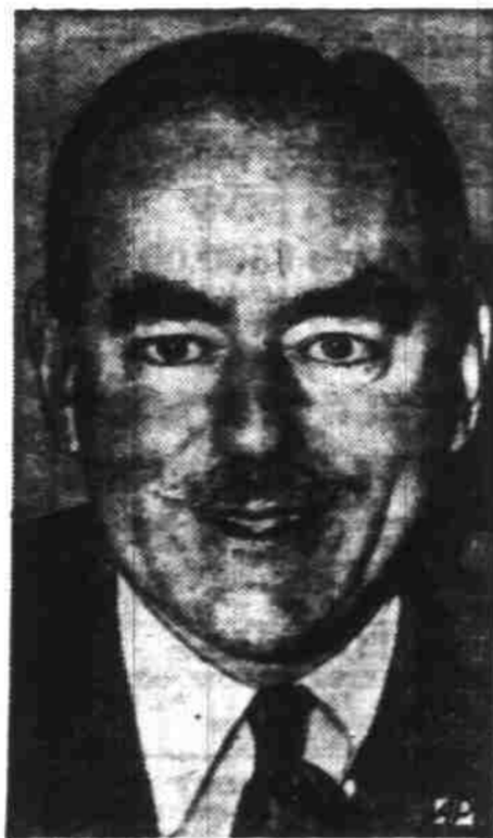
NOMINATED — Dean Acheson, named by President Truman to succeed Gen. George C. Marshall as Secretary of State, smiles as he sits at his desk in Washington.