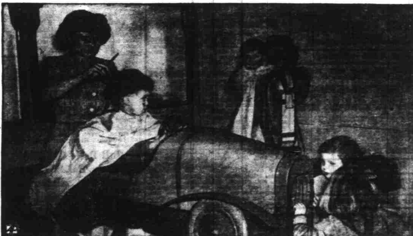
FAST CLIPS — Children ride cars and horses as they receive haircuts while their mothers shop in other parts of a London department store. Youngsters who formerly wept when taken to the barber now protest when taken home.