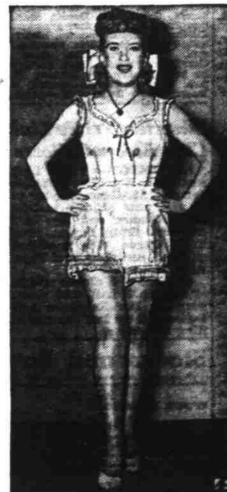
LOSER — Betty Grable looks like this after a fight in her new film in which she starts as a school teacher and becomes a dance hall queen. The picture is still in production.