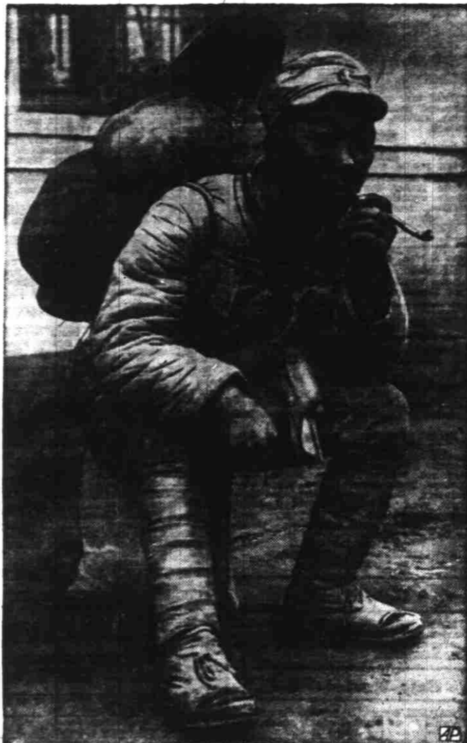
MEDITATION — A Chinese Nationalist soldier sits in a Nanking street and puffs on his pipe during a pause in the march to the Yangtze River front.