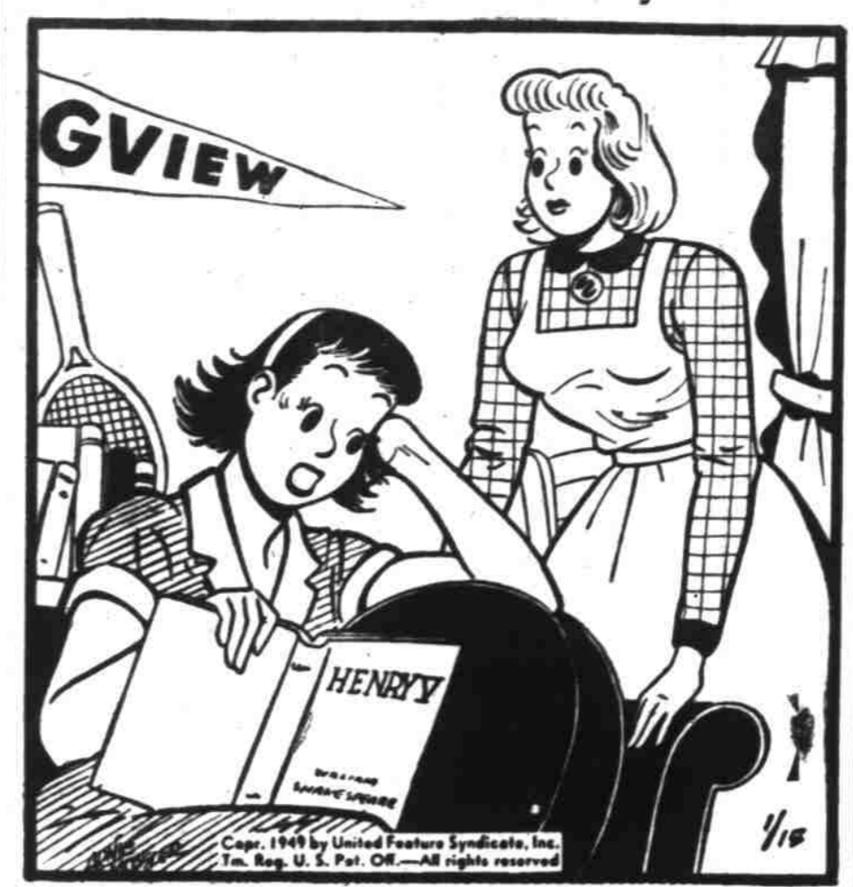
"I'm disappointed . . . It's nothing like the movie!"