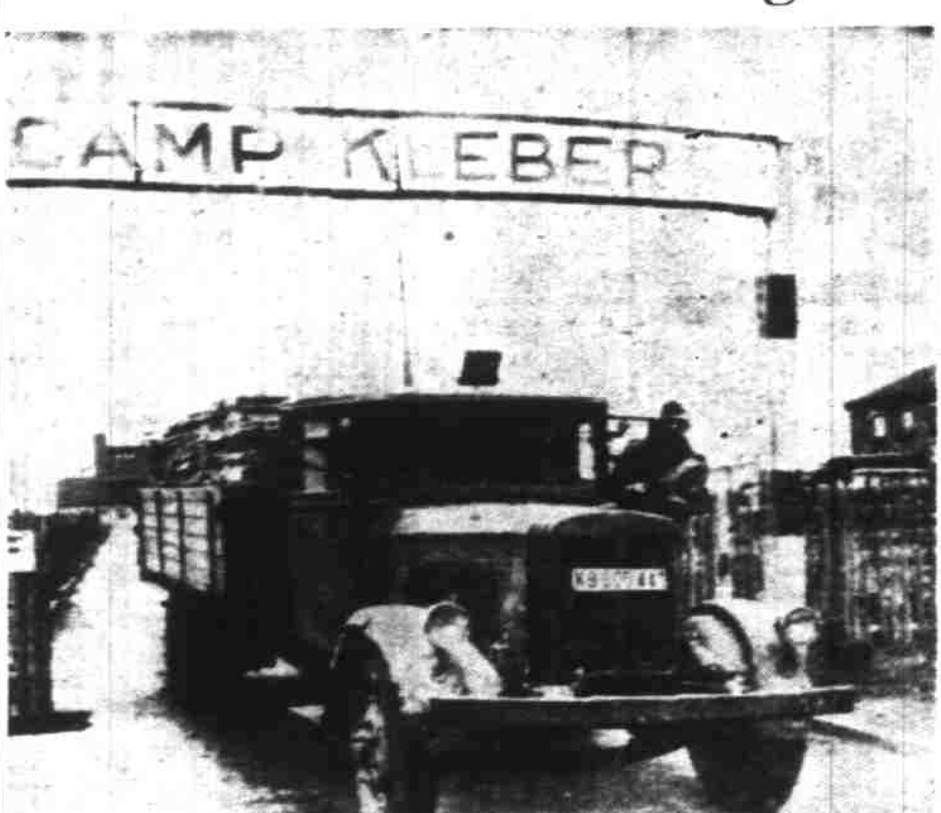
STOLPE, Germany, Dec. 20—A French army truck loaded with equipment leaves military camp in Stolpe Sunday, preparatory to return of the village to Russian control. Stolpe was given to the French for an airbase but the field was never built.