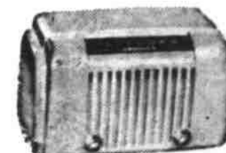
(Also in Ivory-finish plastic) Model 58TL 23.95

You'll be pleased as punch with this bargain in beauty and tone! It's a trim, sleek model in walnut plastic that's right at home wherever you place it! Improved superheterodyne circuit for real distance-getting performance! AC-DC.