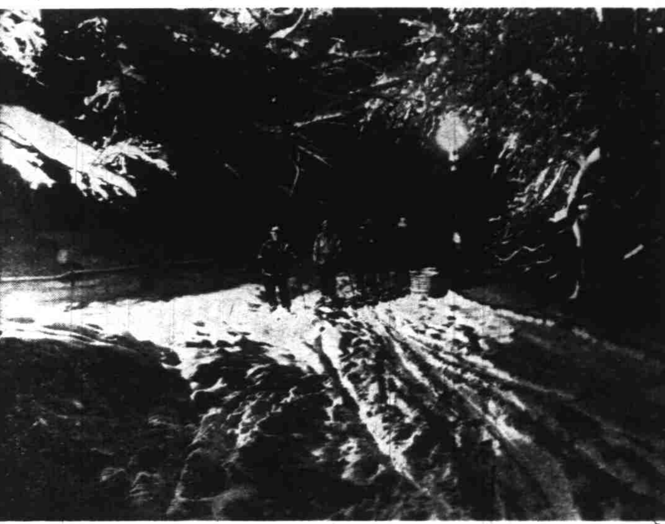
NEW YORK, Dec. 20—Three boys and a girl start on a skiing expedition in Central Park here Sunday night after 19.5 inches of snow blanket the city. The storm ended early this morning and moved out to sea.