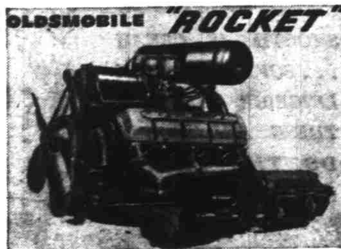
HERE IT IS! Oldsmobile's "Rocket" Engine, which offers all these features: Rigid-Block Valve-in-Head Construction; Dual Down-Draft Carburetion; Five-Bearing Crankshaft; Hydraulic Valve Lifters; Short Sturdy Camshaft; Steel-Reinforced Alloy Pistons. The result: incredible smoothness, spectacular power!