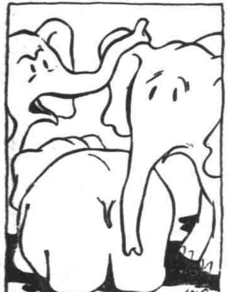
"Stop worrying! Who could possibly kidnap him?"