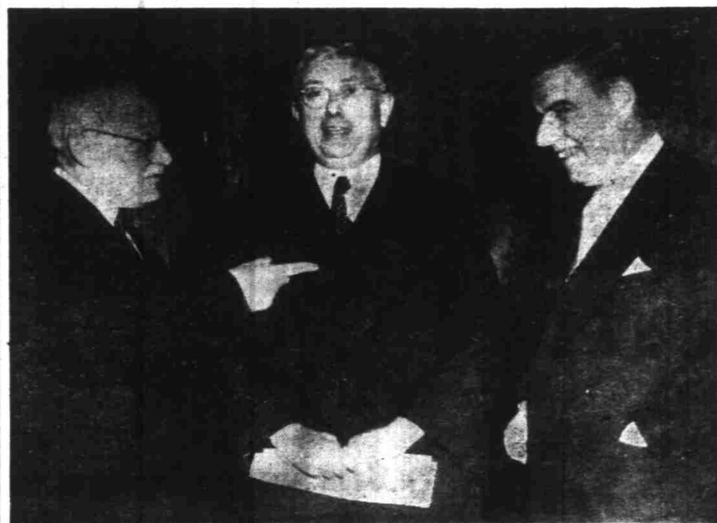
PARIS, Dec. 16—Talking things over during a reception at the Elysee Palace for United Nations delegates in Paris are (left to right) Soviet Deputy Foreign Minister Andrei Vyshinsky, Australian Foreign Minister Herbert Evatt and British Minister of State Hector McNeil. The reception was held in connection with the adjournment, next day, of the United Nations General Assembly.