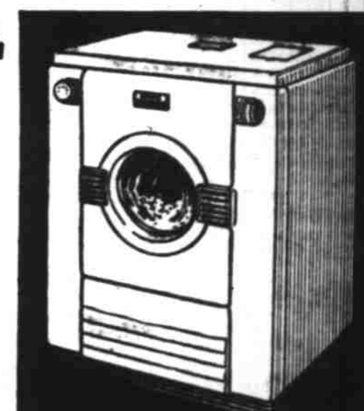
New Bendix Deluxe, Model S-101 (Automatic Soap Injector Option)

Model S-101 FOR ONLY $219.95 including normal installation