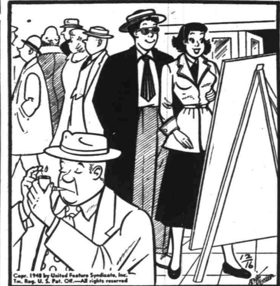
"We ought to go again and WATCH the picture... Looks as though it might have been good!"