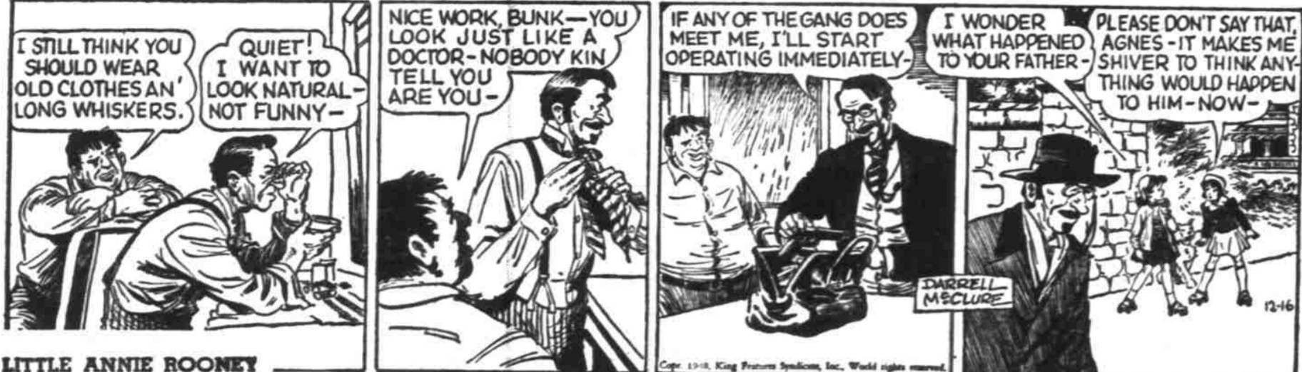
LITTLE ANNIE ROONEY