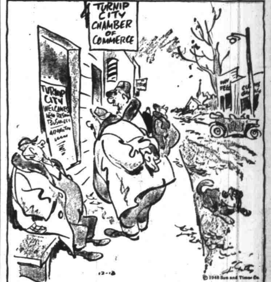
"A fine Chamber of Commerce we got... telling the world there ain't a chance for our town to be a choice A-Bomb target..."