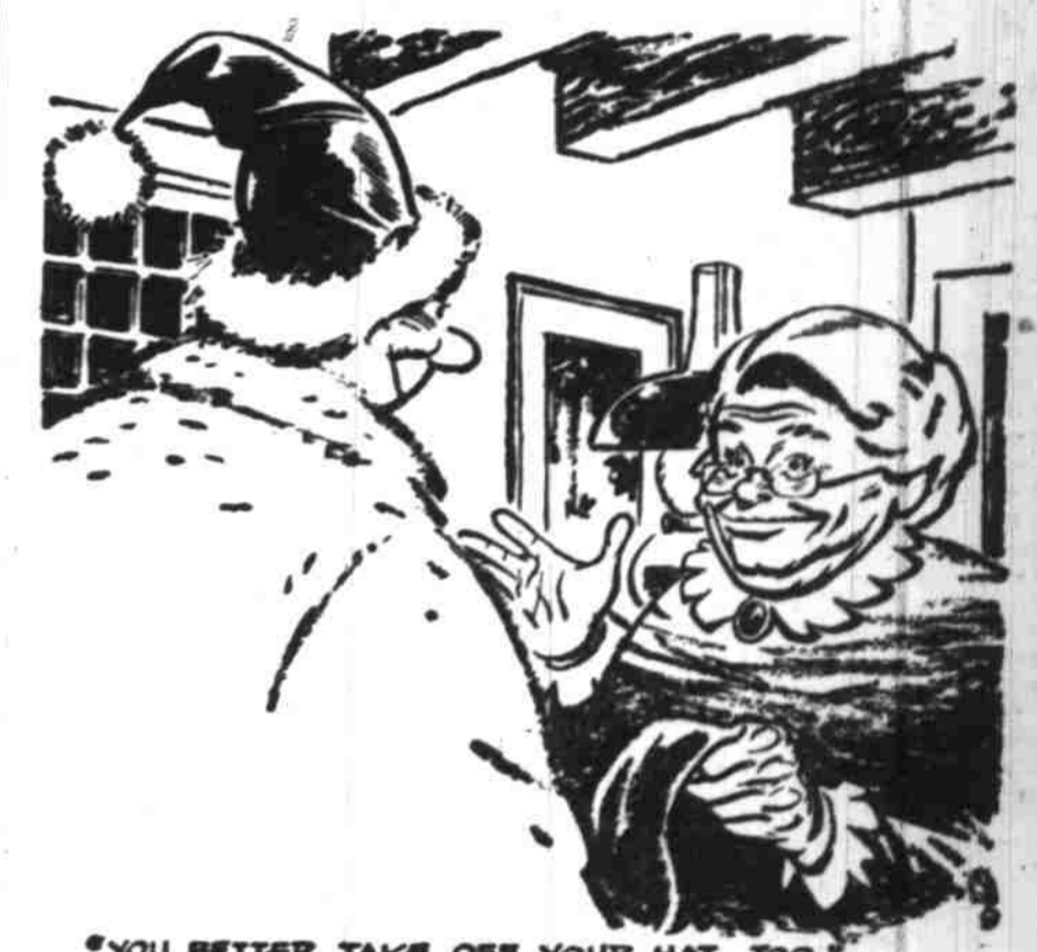
"YOU BETTER TAKE OFF YOUR HAT, TOO."