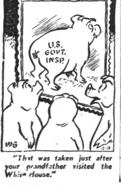
"That was taken just after your grandfather visited the White House."