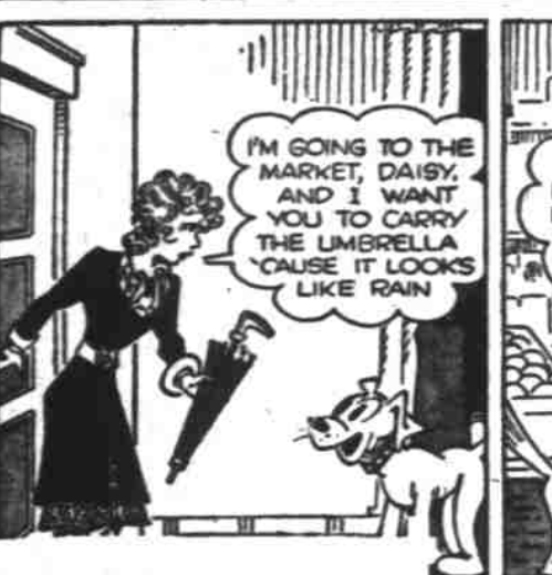
NOW, DON'T RUN AWAY, DAISY --- IT'S STARTING TO RAIN