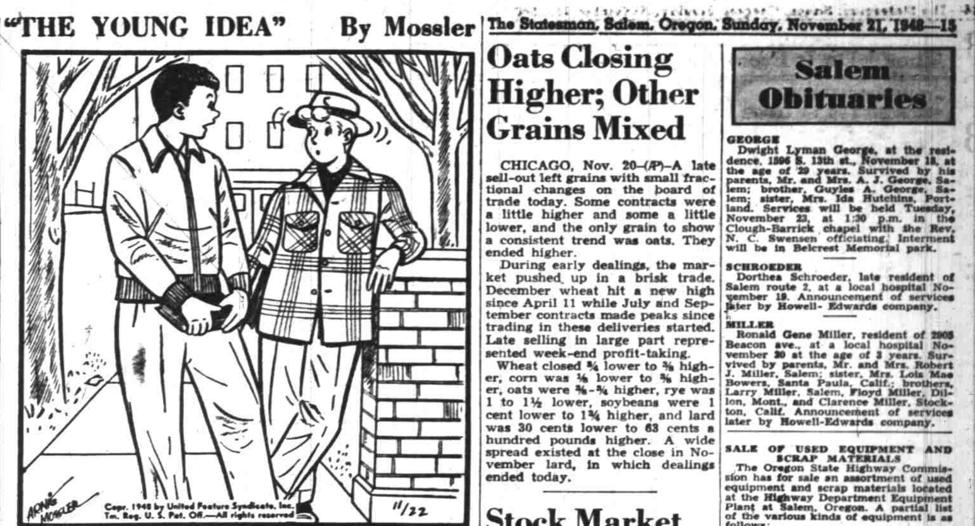
"Women don't bother me ... In fact, they rarely even notice me!"