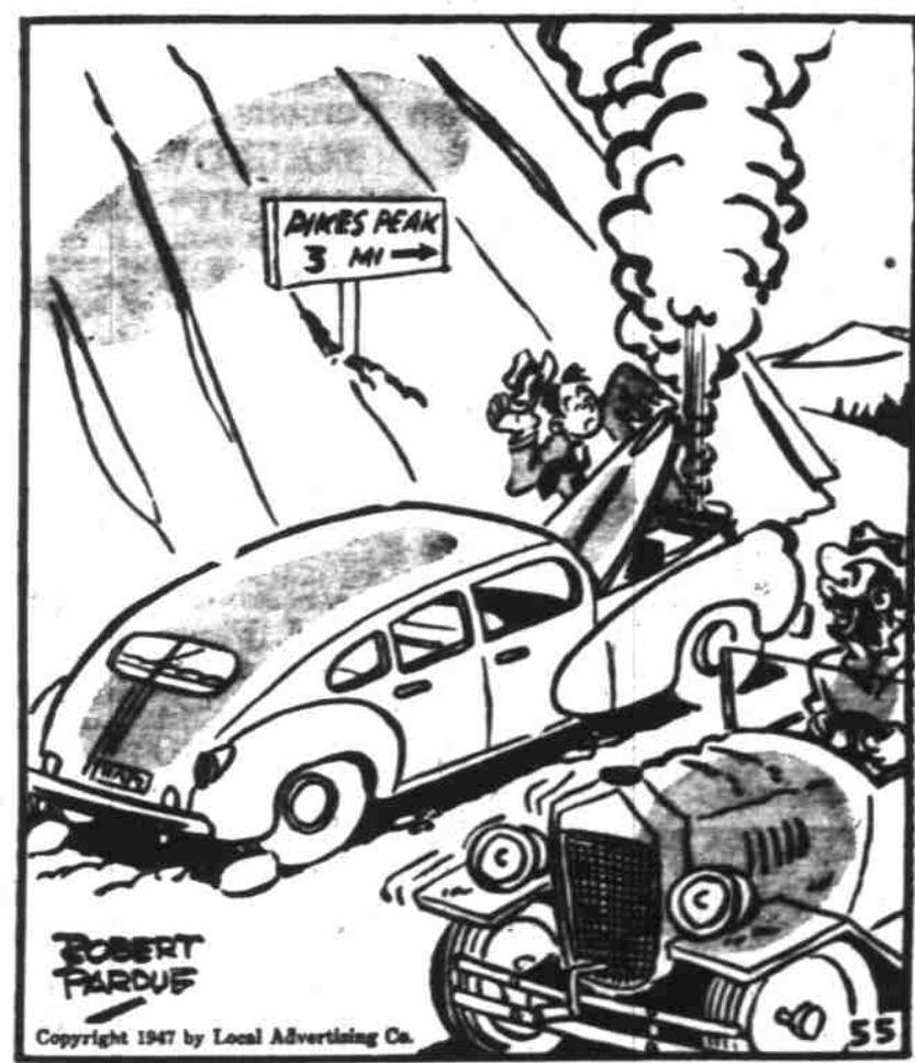
"I made it easy—thanks to a motor tune-up by OTTO WILSON CO."