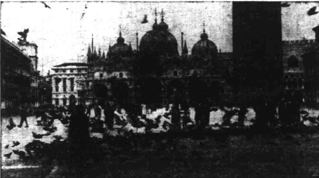
ITALIAN LUNCH COUNTER —Pigeons of Venice gather in St. Mark's Square as a city hall employe empties sack of corn for them. They wait for him each day at 2 p.m.