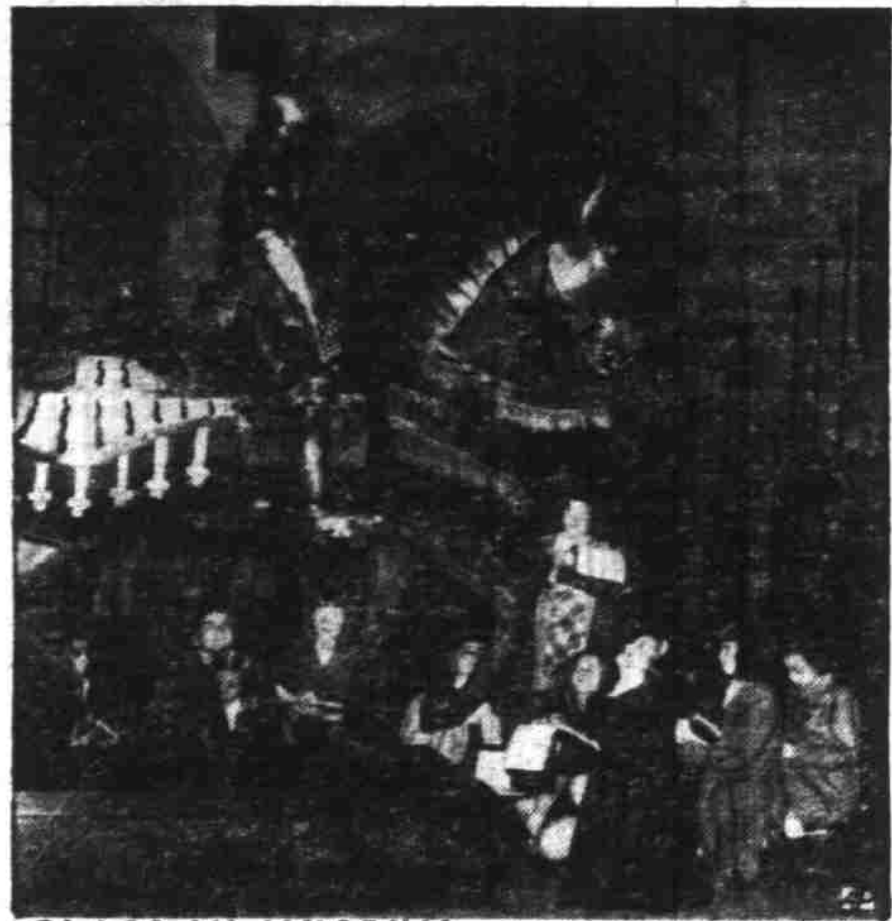
CLASS IN MUSEUM —School children sketch armored knight at Metropolitan Museum of Art, New York.