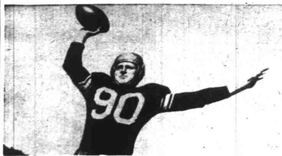
Glenn Dobbs (above) triple threat star of the Los Angeles Dons, ranks at the top of the All-American pro football circuit in offensive performance—and despite a set of damaged ribs and a wrenched back. In ten games Dobbs is credited with 1,946 yards gained by air and land, 353 yard rushing and 1,593 via passing.