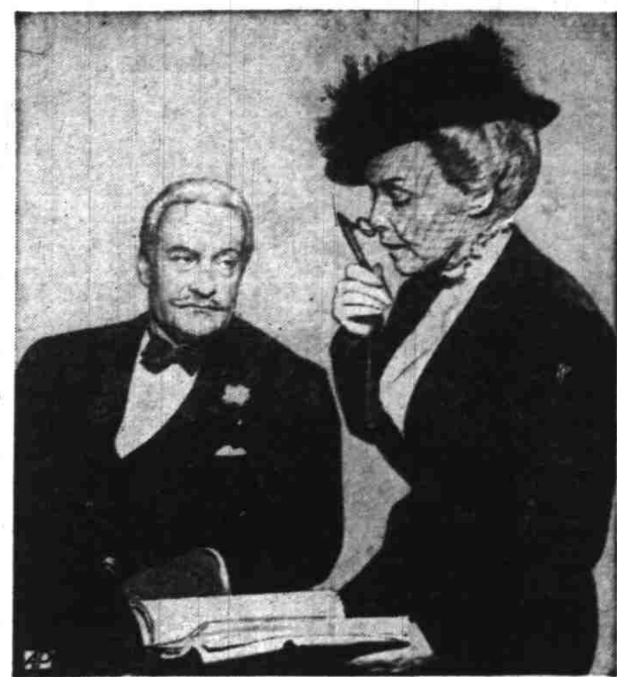
AGED IN RUBBER —Madeleine Carroll and George Sanders are made up as oldsters for Hollywood movie. Liquid rubber applied to their faces in layers gives them sagging "skin."

Capital Drug Store 405 State Phone 3-3118