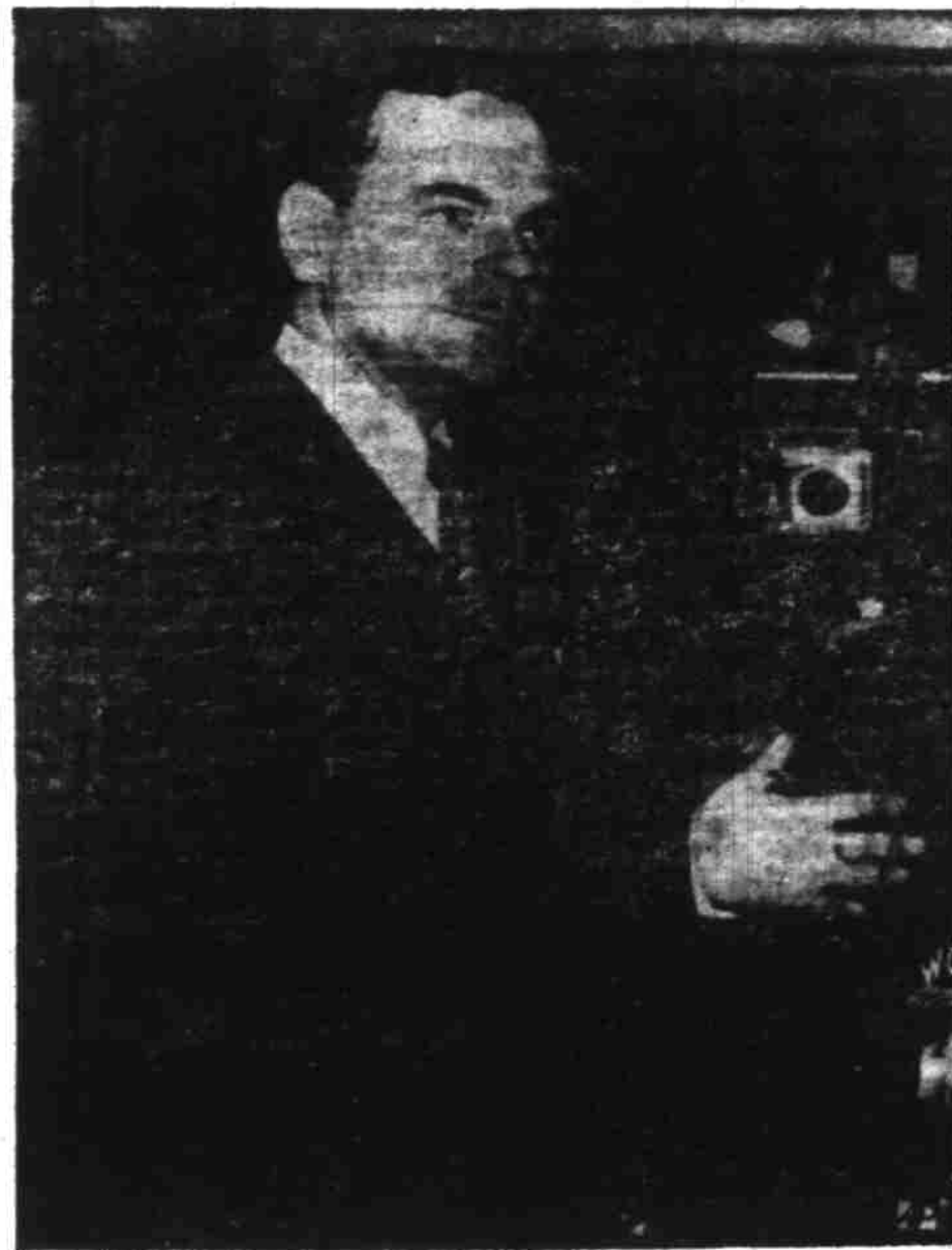
NEW YORK, Nov. 4—One hand in his coat pocket, a sober-faced Gov. Thomas E. Dewey gestures with his left hand as he speaks to reporters in New York, after conceding the election to president Truman. He said it is "pure fiction" that he is planning to resign as Governor.