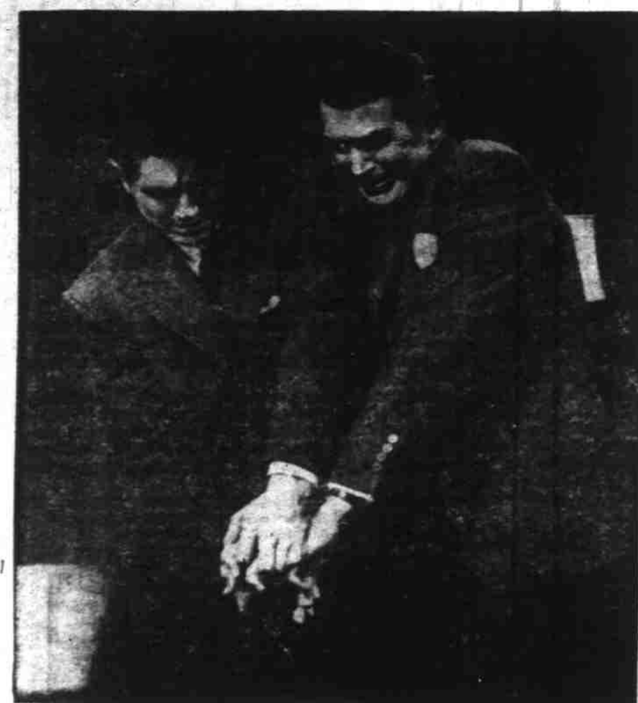
James Stewart and Farley Granger in Alfred Hitchcock's technicolor production, "Rope," at the Elsinore theatre starting Saturday. Dane Clark and Geraldine Fitzgerald are co-starred in the companion picture, "Embraceable You."