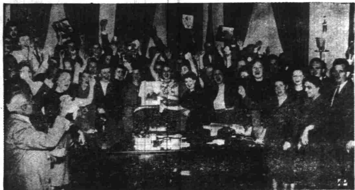
WASHINGTON, Nov. 4—Members of the clerical staff at the White House mass around President Truman's desk after Thomas E. Dewey conceded defeat in the national presidential race.